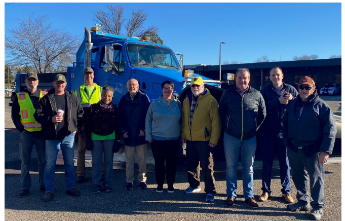
The Lauderdale City Council and public works staff from both cities met in Falcon Heights this fall to discuss plowing operations.

This would be our second winter season with Falcon Heights staff plowing our streets if it ever snowed! The City Council met with the Falcon Heights public works staff to learn about their plowing operations and new technology they implemented. This winter is so different from our last and maybe still a welcome break after last year.