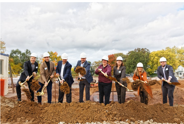
October 6 groundbreaking at The Fern.

This past quarter, the city council discussed residential speed limits. The legislature recently gave authority to city councils to establish reduced speed limits on municipal streets which is why you may be seeing 20 and 25 MPH speed limits on your drives. We received a lot of valuable input from residents around the issue. To change to 20 MPH speed limits requires a speed study be completed. The city engineer is working on this now. The results are expected in late January. If the speed study supports 20 MPH speed limits, the city council can decide to implement that speed. If the report does not, the speed limits can be reduced to 25 MPH. Stay tuned.